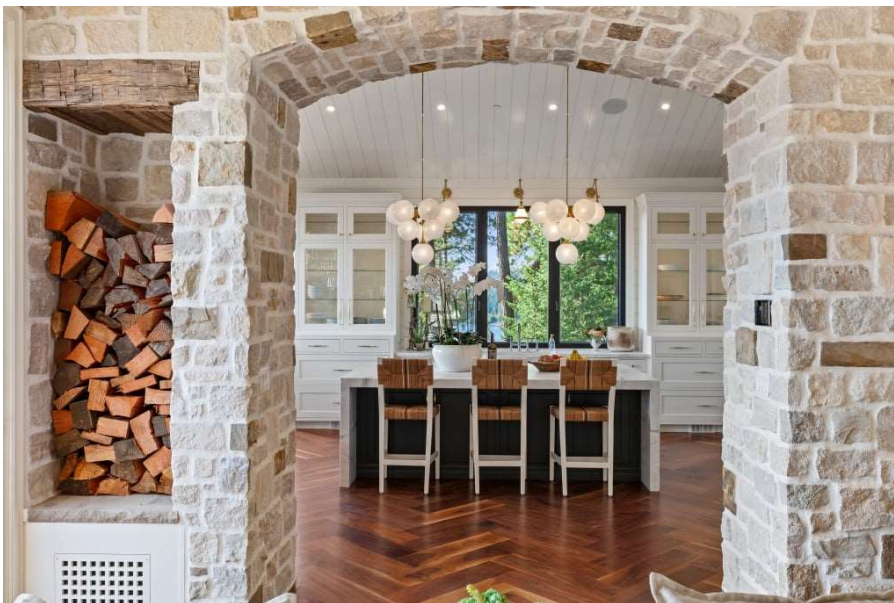
Jewelry-like pendants from Visual Comfort float over the spacious waterfall island in the light-filled kitchen complemented with classic white cabinetry.

That said, the well-appointed interior more than lives up to the majestic setting. Built with niches housing firewood, shelving, a posh bar and the couple's wine collection, weighty stone walls flank two sides of the living room.