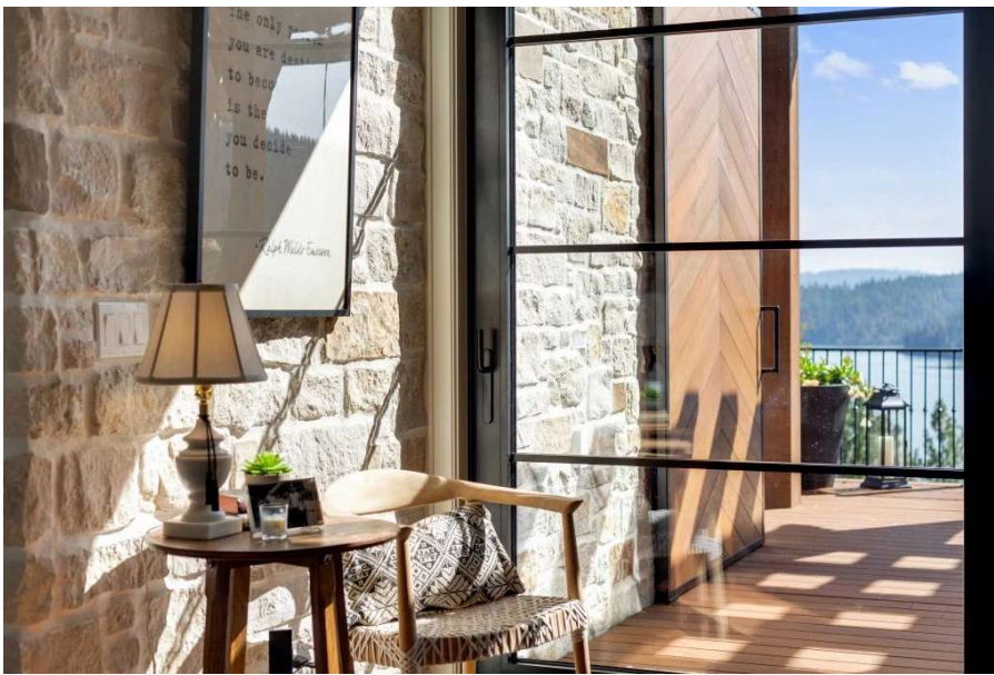
( https://www.mountainliving.com/content/uploads/2022/06/o/l/8792wsteelheadst-51-scaled.jpg ) Modern metal windows by Glo juxtapose rustic stone walls in this custom lakefront abode by Mittmann Architect and Edward Smith Construction.

Often left open, the living area's floor-to-ceiling doors create the sense that indoor and outdoor living areas are one big space. Because large metal windows span the home's water-facing side, however, Mittmann felt free to create distinct interior rooms rather than rely on the sort of wide-open floor plans that are so in vogue. "Your eyes are naturally drawn out to those gorgeous views," she explains.